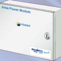
APM-25 Area Power Module Code: 6039