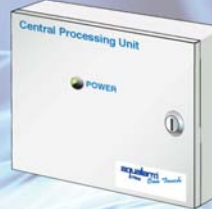
CPU-1000 Central Processing Unit Code: 6038